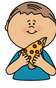
Eat your breakfast