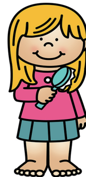
Brush your hair