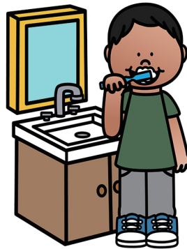
Brush your teeth